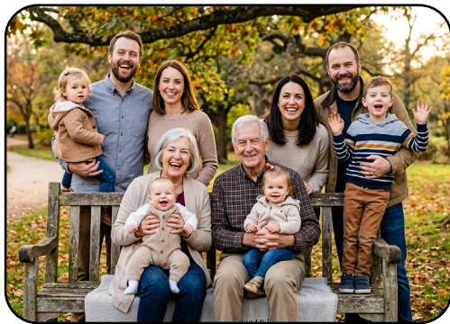
“Honor your father and mother,” which is the first commandment with promise.