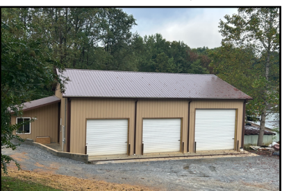
New Auto Shop 2026