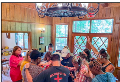
Women’s Campus opened 2019