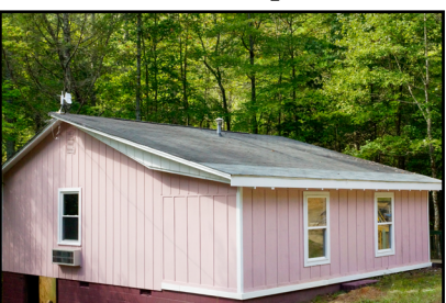
Women’s Campus cabin #4