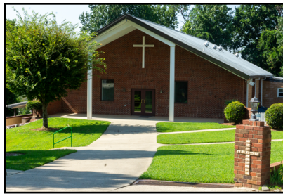
Worship Center 2003