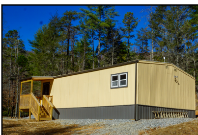
Grace/Counseling, audio, canteen TV lounge 2022