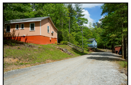
Women’s Campus cabins #2&3