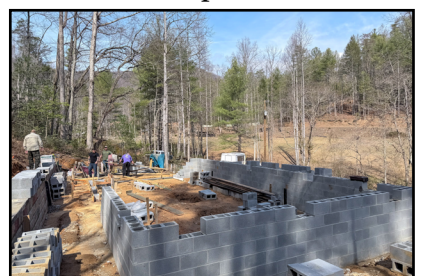
Ruth’s Refuge (staff duplex) in progress