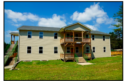
The Rock/dormitory 2014