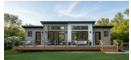
AI rendition of completed house