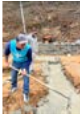
pouring the footers

Thank you for praying specifically for the following: