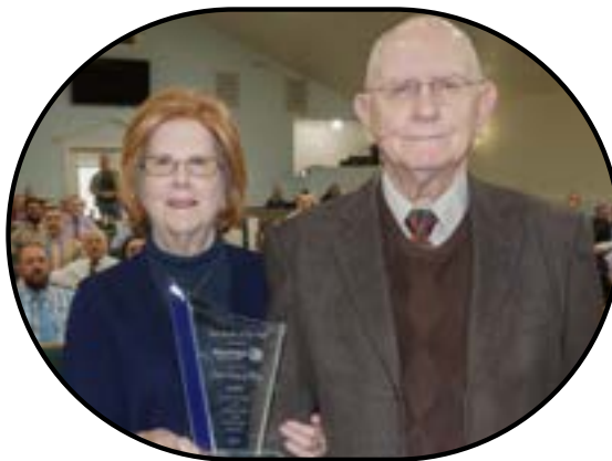
Caldwell County Chamber of Commerce Non-Profit of the Year award presented to Bethel by Blue Ridge Energy

This is a subject that is not emphasized enough. It is stressed in sporting events and the apostle Paul even uses that as an example to teach the principle. It is important that we have this attribute in our character, it will make the difference in our marriages, other relationships, our ministry to others, and our ability to walk out an overcoming life. Jesus calls us to obedience, to commit full-hearted to that obedience, and He calls us to finish what God called us to do. Phil 1:6 admonishes us to "be(ing) confident of this very thing, that He who has begun a good work in you will complete it until the day of Jesus Christ." The Lord will help us run and complete the race.